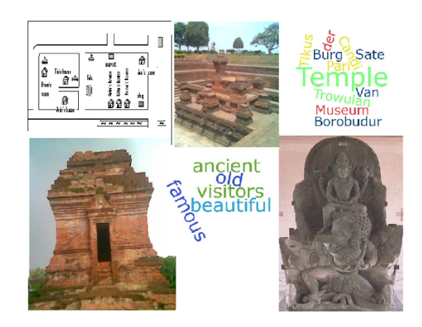
Figure 1. relevant pictures are given to illustrate the questions that creating better understanding.

As a warmer, sorts of pictures can be really helpful.